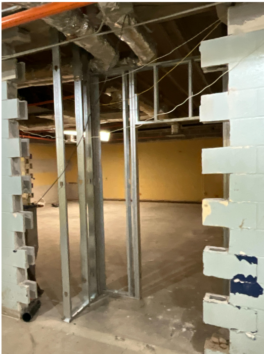
Stud wall framing in classrooms on level 1.