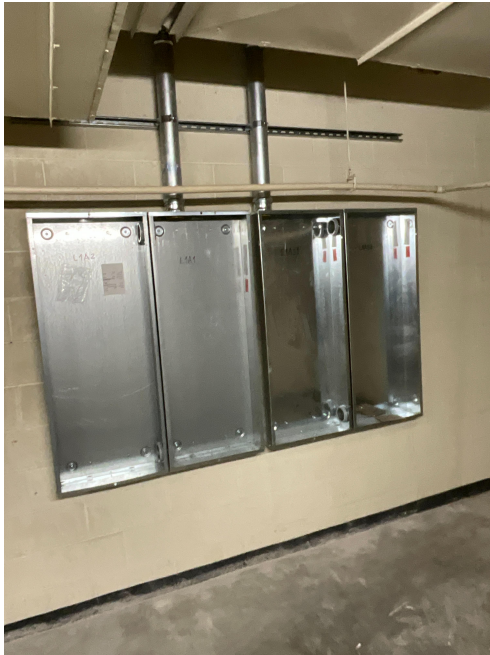
Electrical panel boxes in the electrical room on level 1.