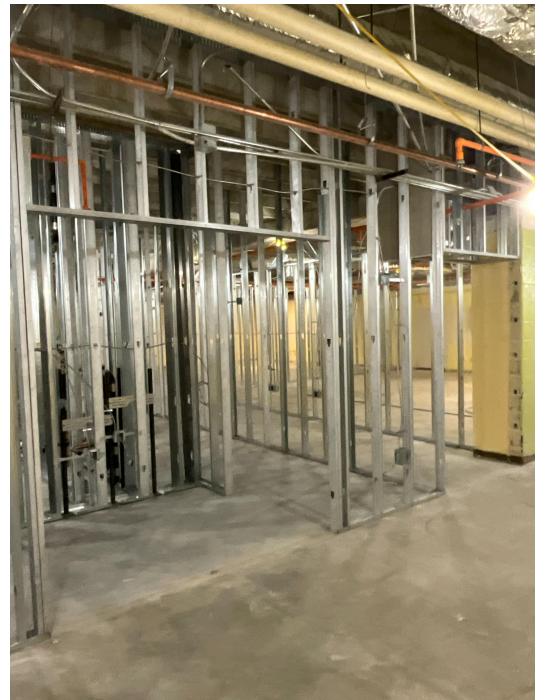
Stud wall framing in restrooms on level 1.